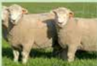
High Survival, High Performance Romneys Plus new Worm resistant line!