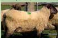
Terminator tough hill-bred sire