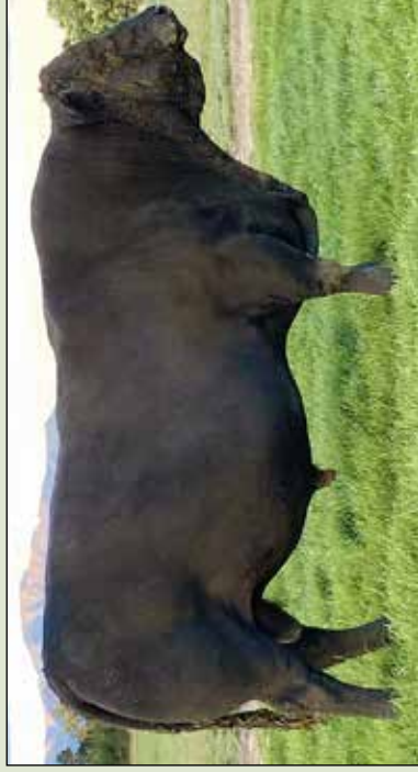
TURIHAUA CRUMP E5