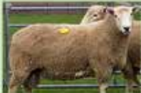
1/2 Perendale x 1/2 Romney (Romdale) 1/4 Perendale x 1/4 Texel x 1/2 Romney